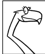
the mother flamingo