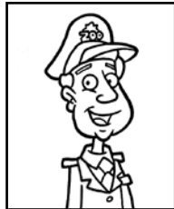
the zoo keeper